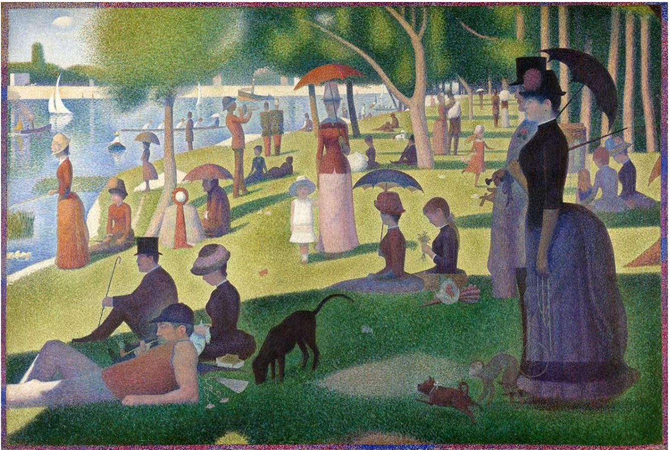
Georges-Pierre Seurat, A Sunday Afternoon on the Island of La Grande Jatte (Galabnimo Axad Jasiiradda La Grande Jatte), 1884–1886

Falanqaynta Art: La Grande Jatte Name - Magaca: