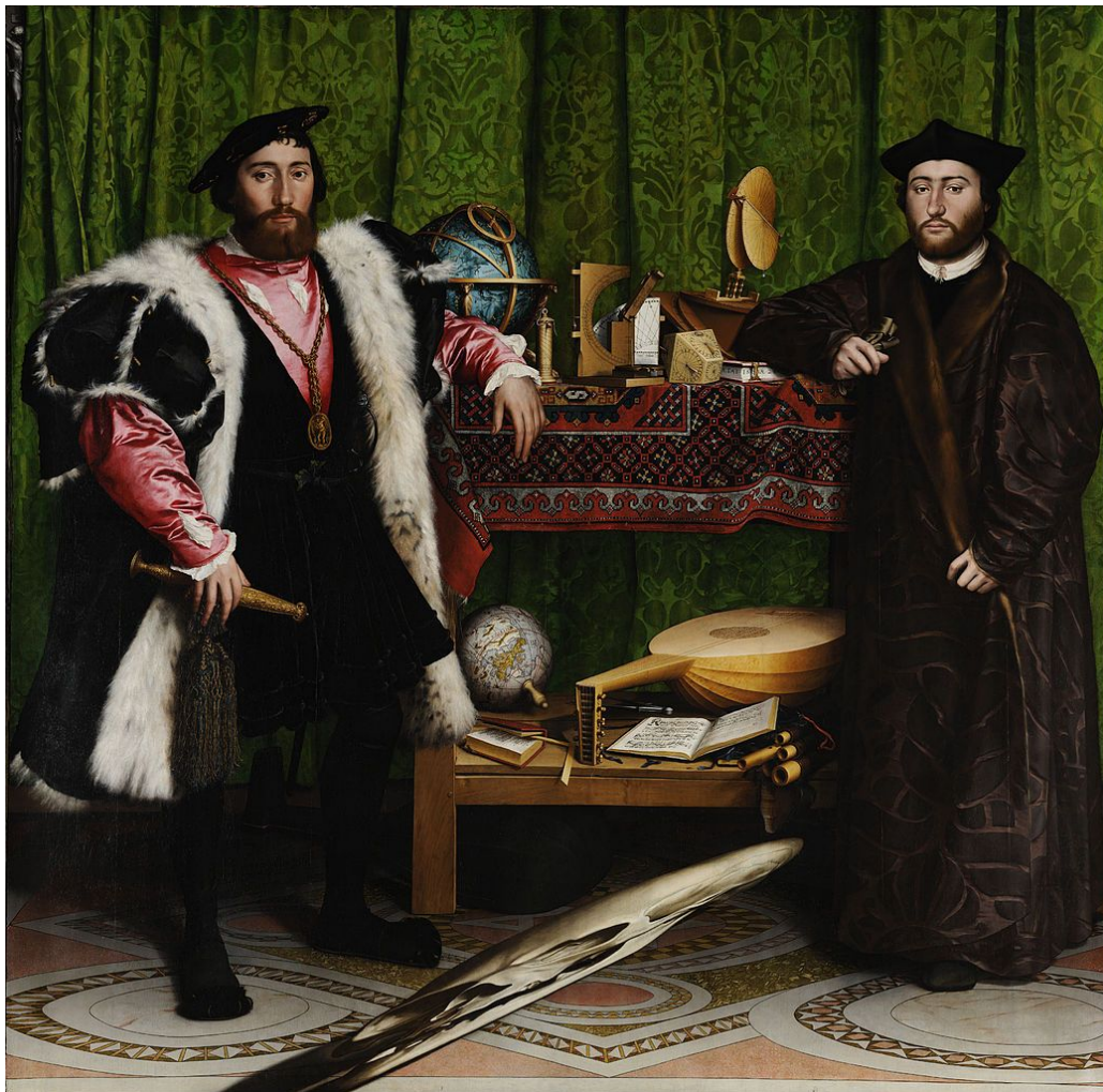
Hans Holbein, The Ambassadors (Safiirada) , 1533

You are allowed to use phone or computer-based translation for this assignment. If you do, please send the results to: ddrapak@gnspes.ca .