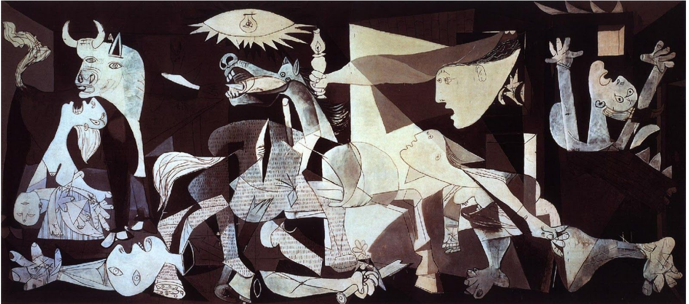
Pablo Picasso, Guernica , 1937

When this painting was made, most people would have been aware that the small Spanish village of Guernica was bombed by Italian and German warplanes. The Pro-Fascist Spanish government believed the village contained anti-Fascist rebels, and asked Italy and Germany to help fight.